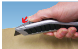
Push blade out to begin cut.