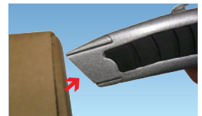
Blade automatically retracts after cutting. This prevents accidents.