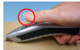
Release blade slider while cutting.